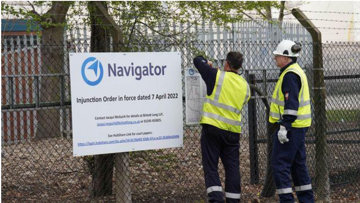
Signs are fixed to fences outside the Navigator oil terminal. The demonstrations have led to fuel shortages in Suffolk

A teenager from Thurston, near Bury St Edmunds, had previously been arrested as part of a protest in Thurrock on April 1.