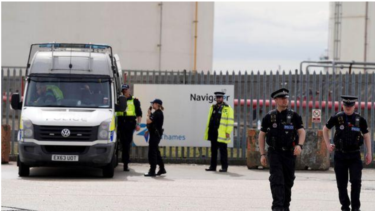
Police officers at the Navigator oil terminal in Grays, Essex, following protests

Police have arrested more protestors at oil depots in south Essex as the shortage of fuel in the region continues.